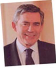
THE PRIME MINISTER