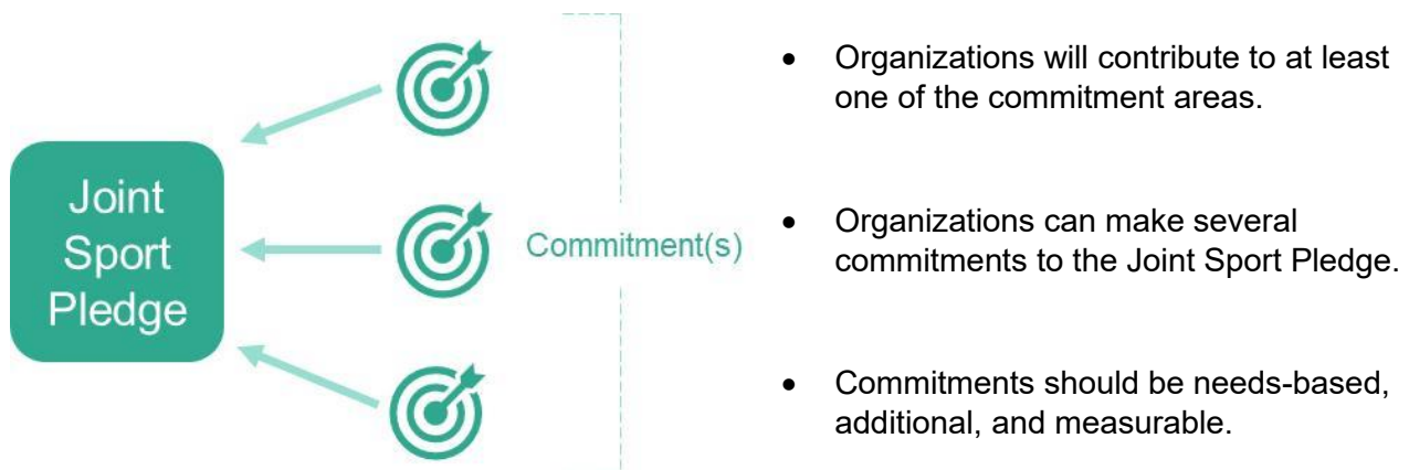
Figure 3: Pledge vs. commitment overview

Everyone can make a commitment. A commitment is unique to each organization or committing entity. A commitment details the actions you will take and the changes they will make, as a contribution to the overall Joint Pledge on Sport 2023.